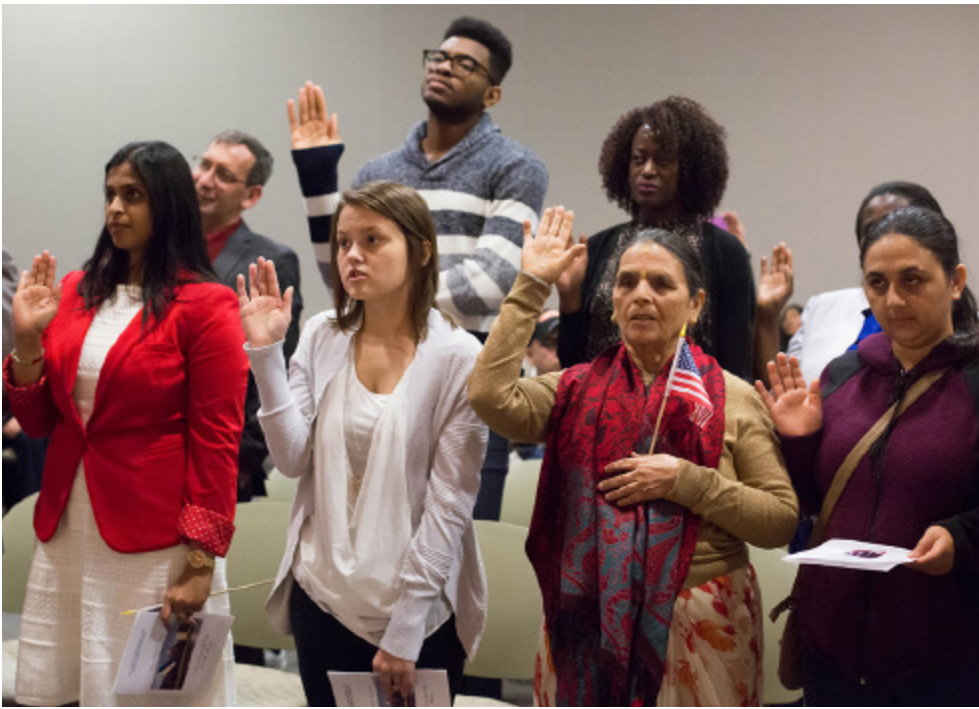
Immigrants take the Oath of Allegiance, which completes their process of becoming a U.S. citizen, at the Naturalization Ceremony in the SSB auditorium on March 10.