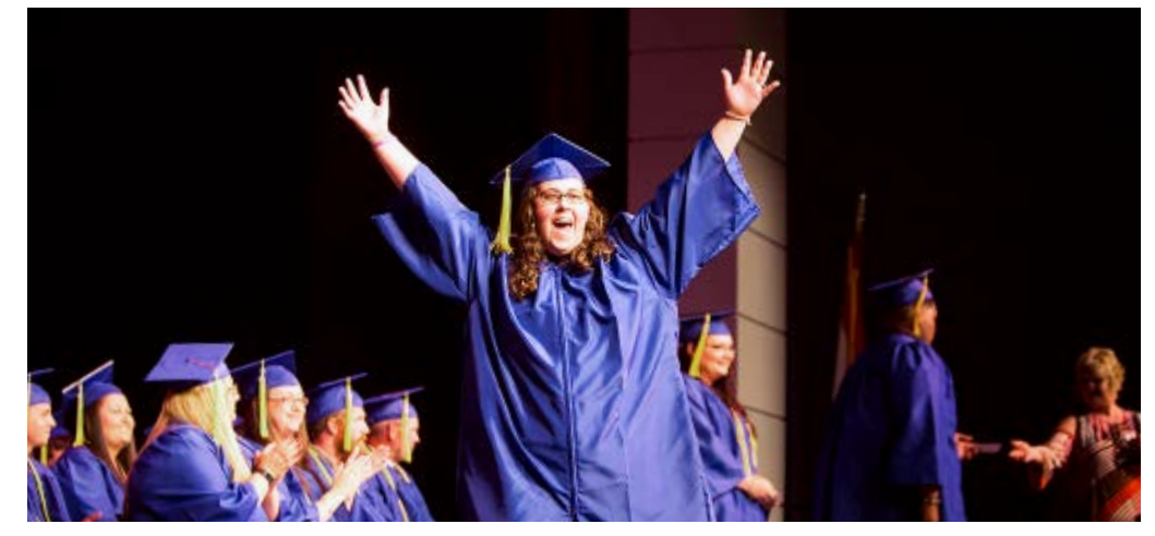
Students were honored for their achievement at the 2017 Adult Education & Literacy (AEL) recognition ceremony on June 8 at SCC.

Thirty-one students were acknowledged for their achievement, improvement and attendance in the English as a Second Language