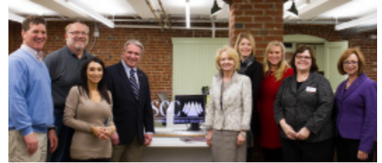
SCC students and administrators gathered Jan. 25 for the space dedication ceremony at OPO Startups in St. Charles.