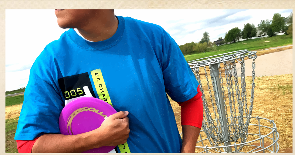
A closeup view shows a disc and basket on the expansive nine-hole disc golf course at the new College Meadows Park. The park is a joint development and partnership between St. Charles County Parks and SCC.