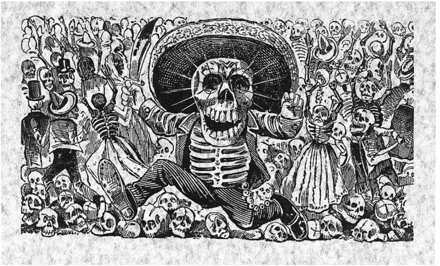
Calavera Oaxaqueña (1910) – José Guadalupe Posada