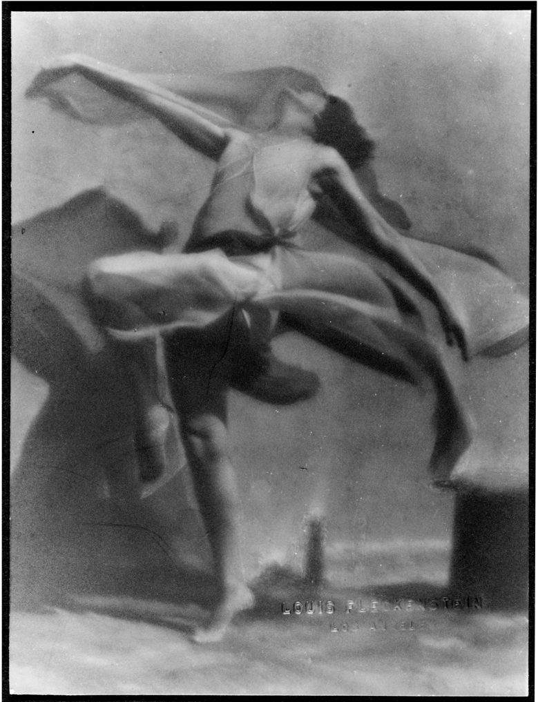
Spirit of the Storm (c. 1925) – Louis Fleckenstein