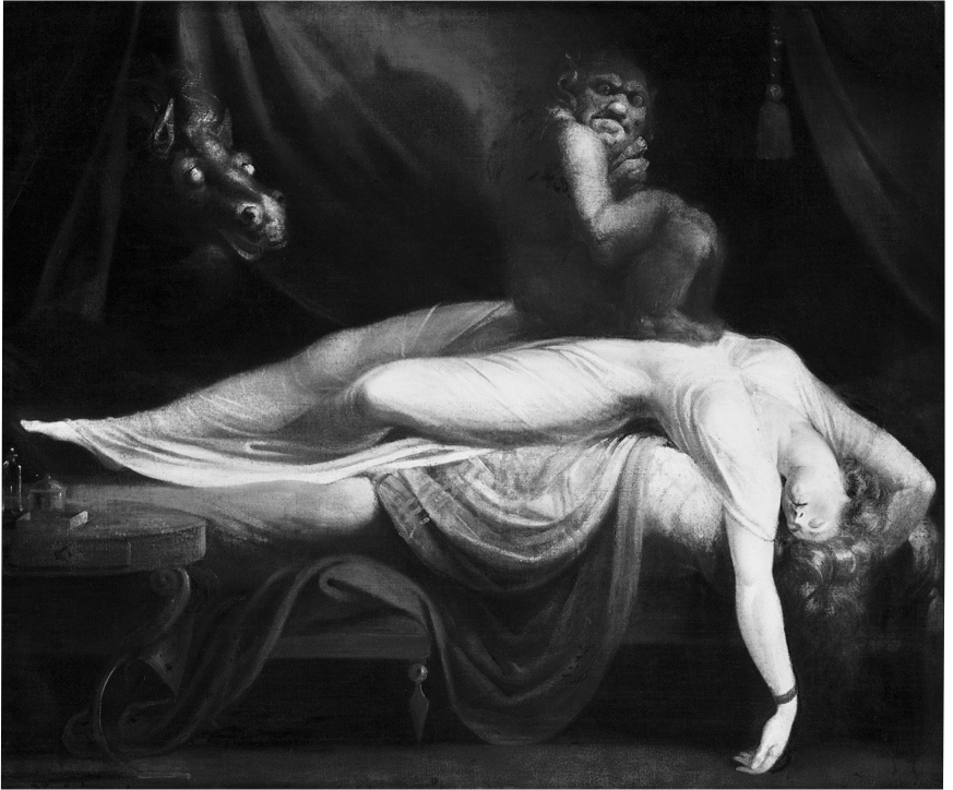
The Nightmare (1781) – Henry Fuseli