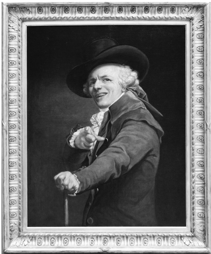
Self-portrait of the Artist in the Guise of a Mocker (c. 1790) – Joseph Ducreux