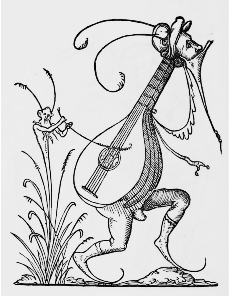
From The Drolatic Dreams of Pantagruel (1565) – Richard Breton.