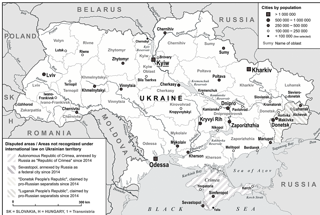
Map of Ukraine